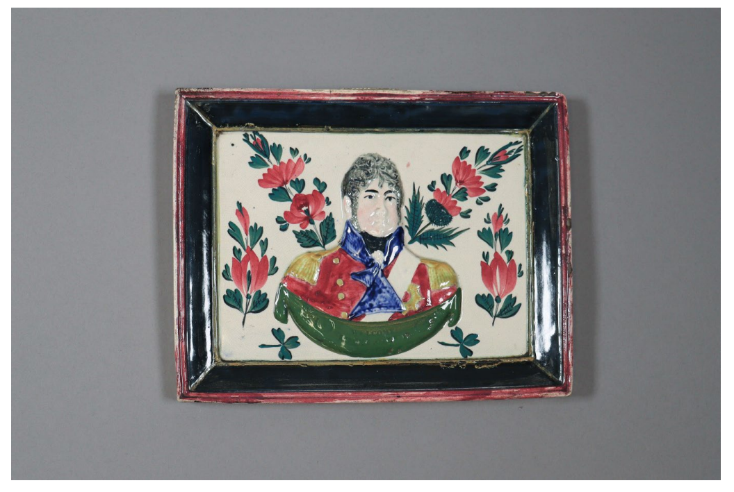
A plaque made in Portobello to mark the Royal Visit of George IV in 1822 (City of Edinburgh Council Museums and Galleries)

10 August saw the launch of a new digital exhibition by Museums and Galleries Edinburgh that explores the impact and legacy of a landmark royal visit. The Royal Visit of George IV to Edinburgh, 1822: Making a city fit for a King enables visitors to view objects made for the visit via a map showing the locations of pageants, ceremonies and other events held for the King, the first reigning monarch to visit the capital in nearly 200 years. The objects showcased are from our own collections, and many were photographed recently as part of our Auld Reekie Retold live inventory work at the Museum of Edinburgh. The exhibition has been developed in partnership with Libraries, who have produced their own companion exhibition on Sir Walter Scott and his orchestration of the royal visit. Libraries' Our Town Stories platform hosts both exhibitions. You can view the exhibition here: The royal visit of George IV to Edinburgh, 1822: making a city fit for a King - Our Town Stories