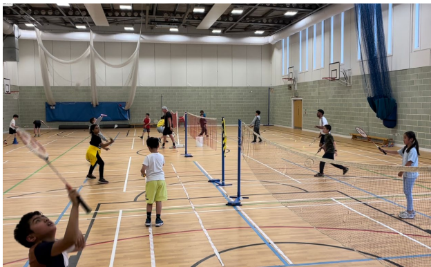
"By far the best summer camp/ activity we have put our kids into. So happy to see our daughter enthusiastic to go every morning, running to get her stuff ready and bouncing into the class!"

"Kids loved it, I felt good sending them to a class where they wanted to go and it wasn't just 'babysitting' - kids made new connections and had fun."